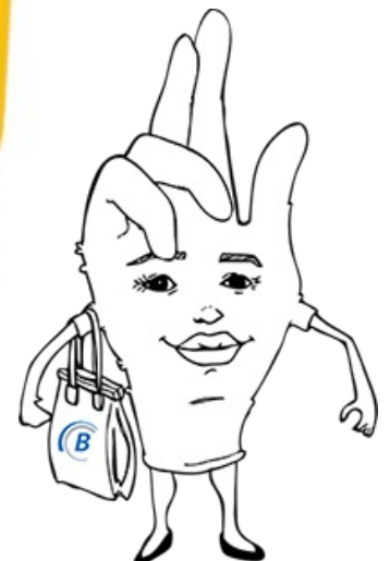
Ms. G. Love™ represents BioClean's range of cleanroom gloves